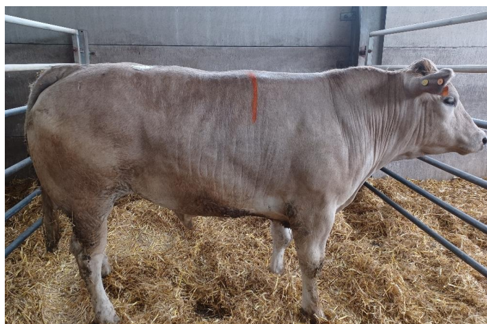
Top Price Bullock